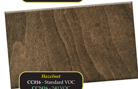
Hazelnut CC016 - Standard VOC CC2416 - 240 VOC