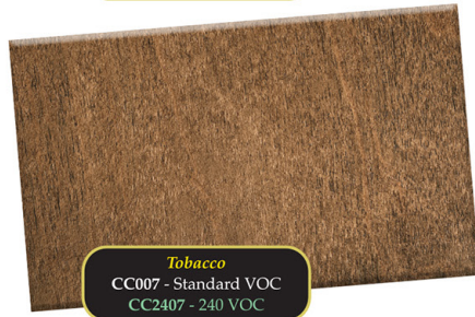
Tobacco CC007 - Standard VOC CC2407 - 240 VOC