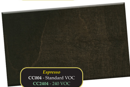
Espresso CC004 - Standard VOC CC2404 - 240 VOC