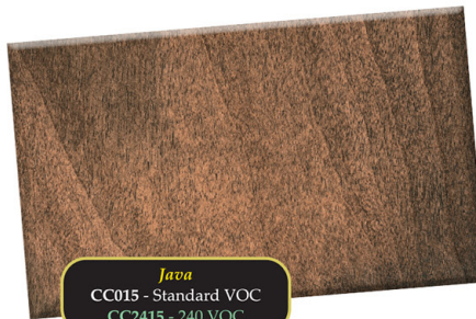
Java CC015 - Standard VOC CC2415 - 240 VOC