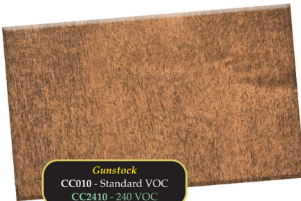
Gunstock CC010 - Standard VOC CC2410 - 240 VOC