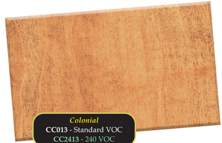
Colonial CC013 - Standard VOC CC2413 - 240 VOC

ATTENTION Due to different substrates, wood density, sanding, wiping, application methods and atmospheric conditions always check actual stain color for accuracy before finish work process begins. Gemini is not responsible for color variance following application of the product.