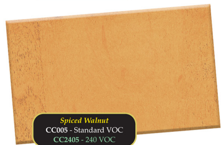
Spiced Walnut CC005 - Standard VOC CC2405 - 240 VOC