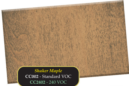
Shaker Maple CC002 - Standard VOC CC2402 - 240 VOC

The Craftsman Collection of premium wiping stains are available in two formulas CC00XX-Standard VOC and CC24XX - 240 VOC. The Craftsman Collection is a spectacular fusion of color and technology that offers you the very best in wood stains!