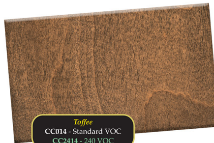
Toffee CC014 - Standard VOC CC2414 - 240 VOC