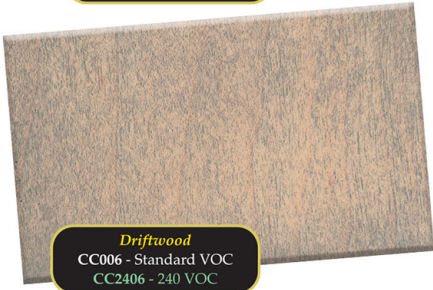
Driftwood CC006 - Standard VOC CC2406 - 240 VOC