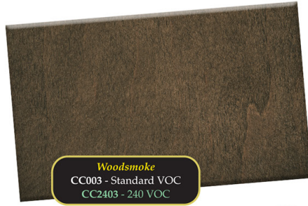
Woodsmoke CC003 - Standard VOC CC2403 - 240 VOC