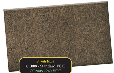
Sandstone CC008 - Standard VOC CC2408 - 240 VOC