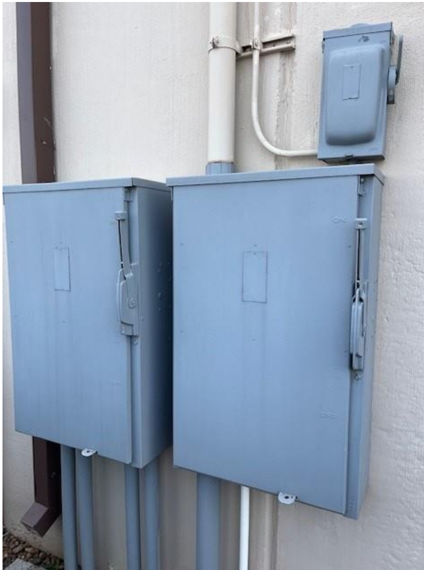
Figure 2: Electric Shutoff (Outside West)