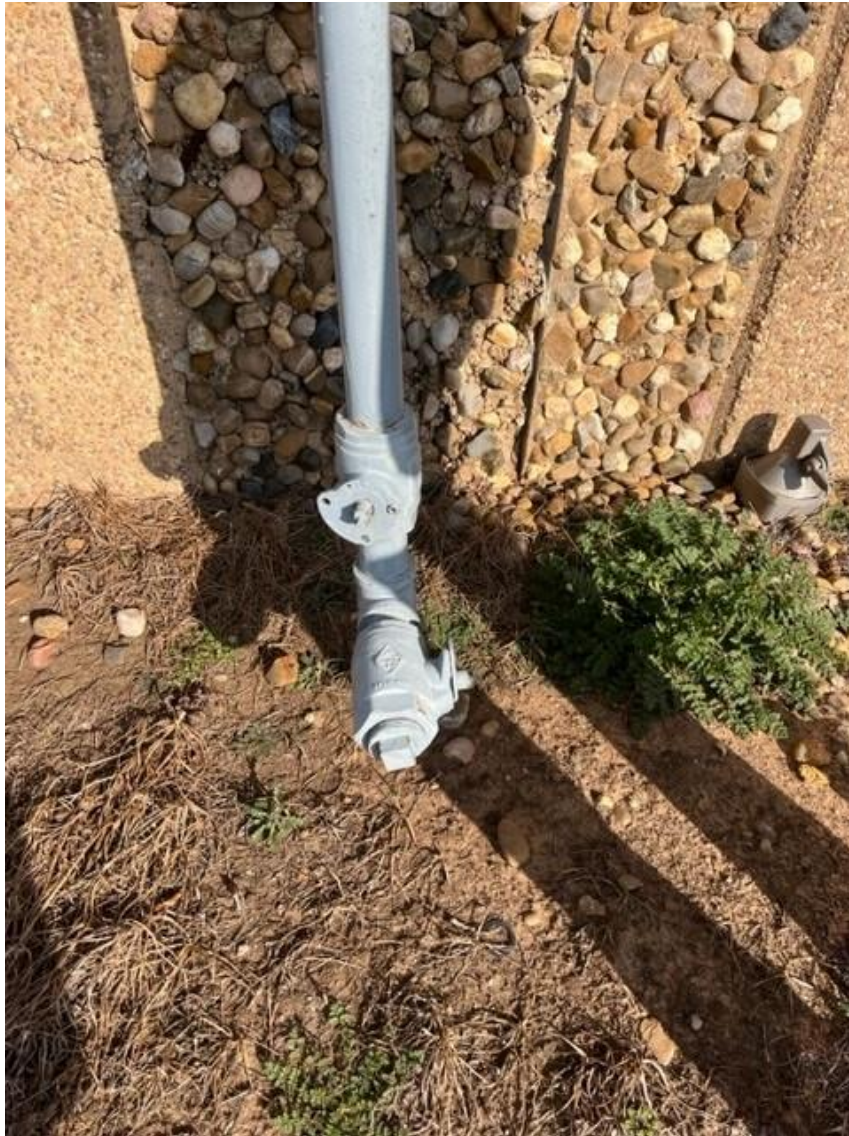
Figure 4: Gas Shutoff #2 (South)