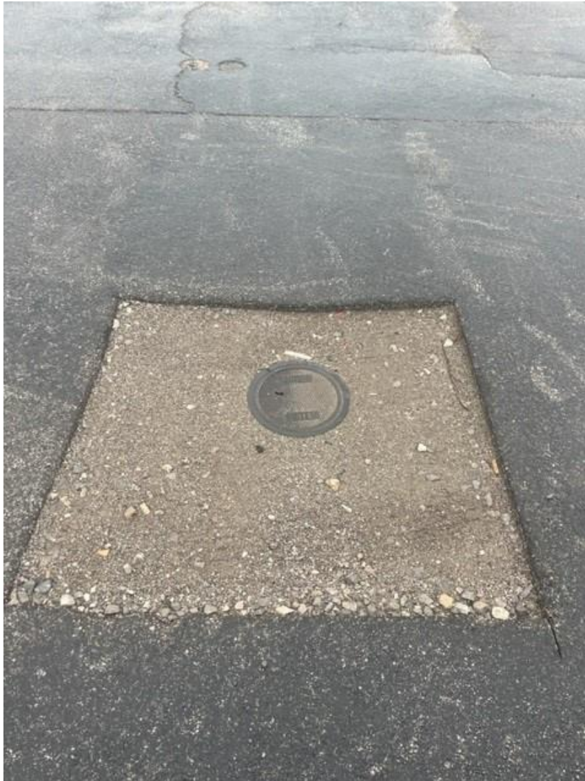
Figure 5: Water Shutoff (SW Parking Lot)