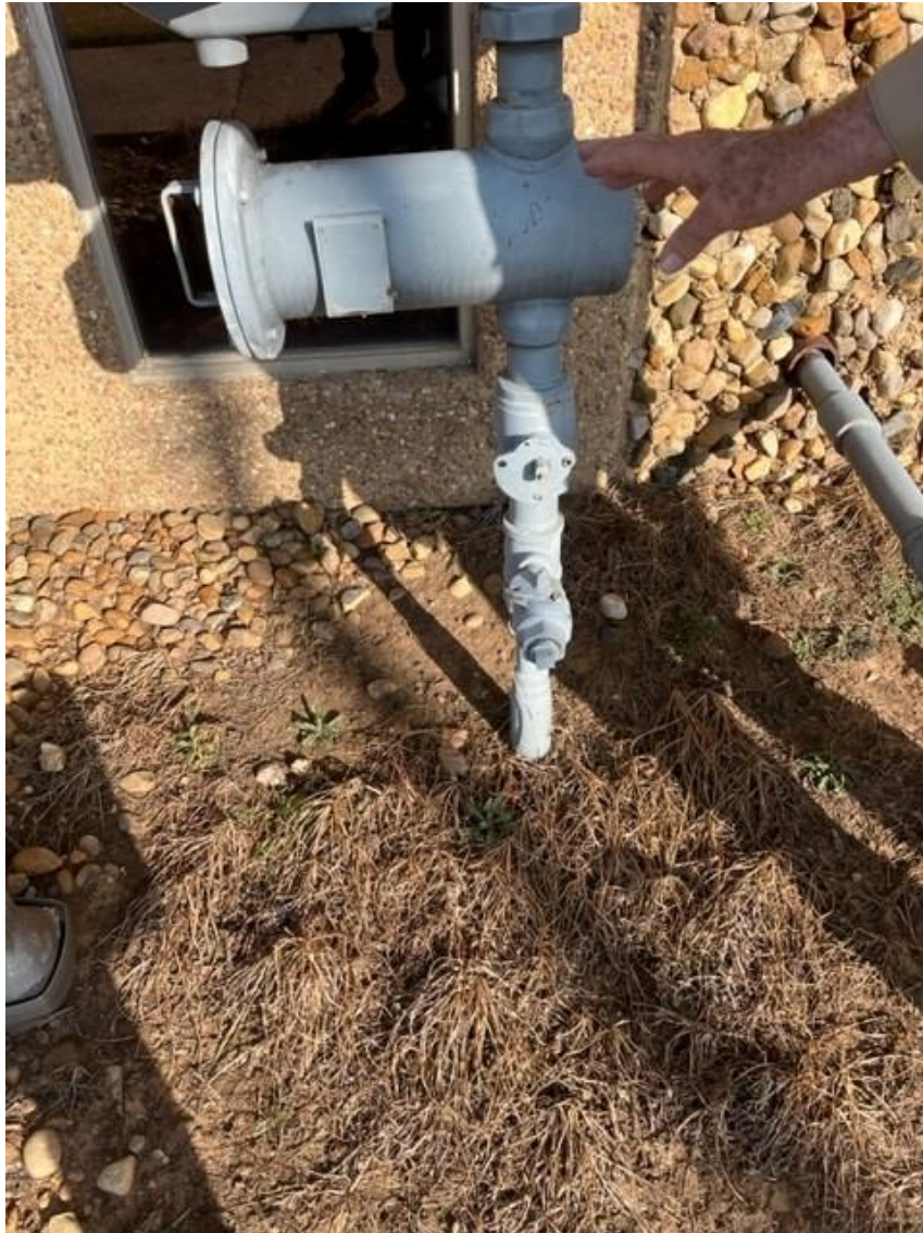
Figure 3: Gas Shutoff #1 (South)