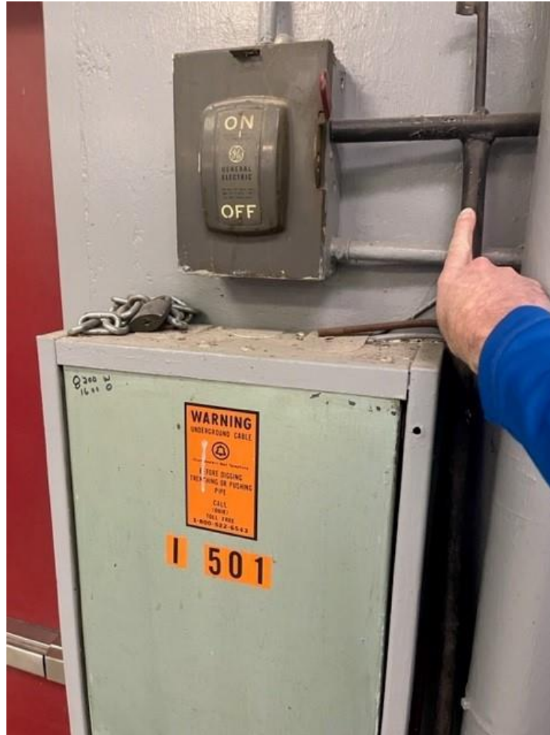
Figure 6: Water Shutoff Tool